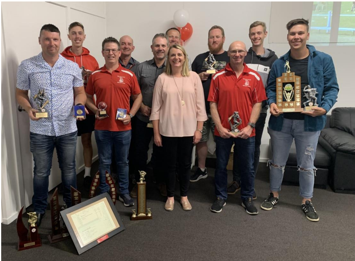
Season 2019-20 presentation was finally able to be held during the 2020-21 season