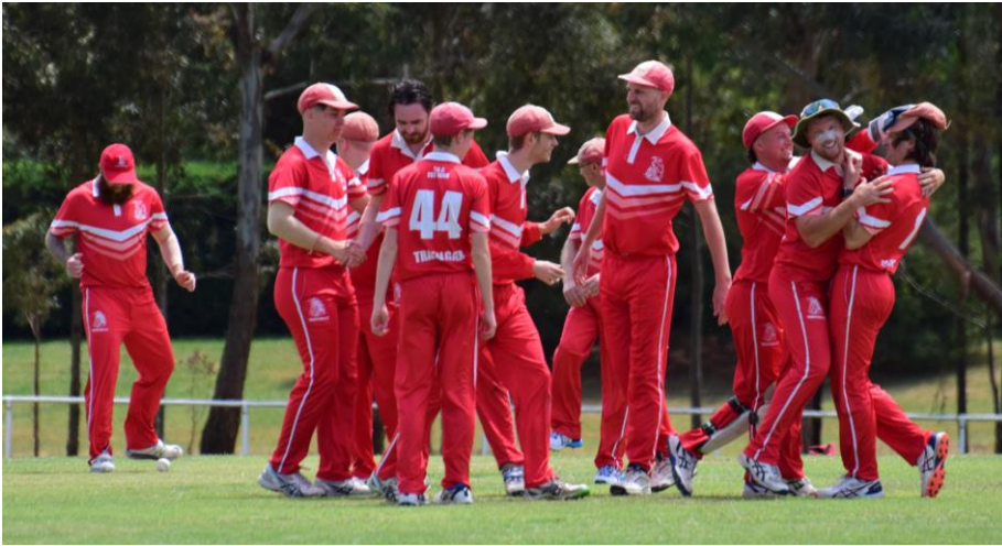
A Grade players celebrate a wicket at Churchill