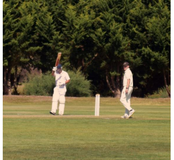
Rhys Holdsworth brings up 150 against MTY Raiders