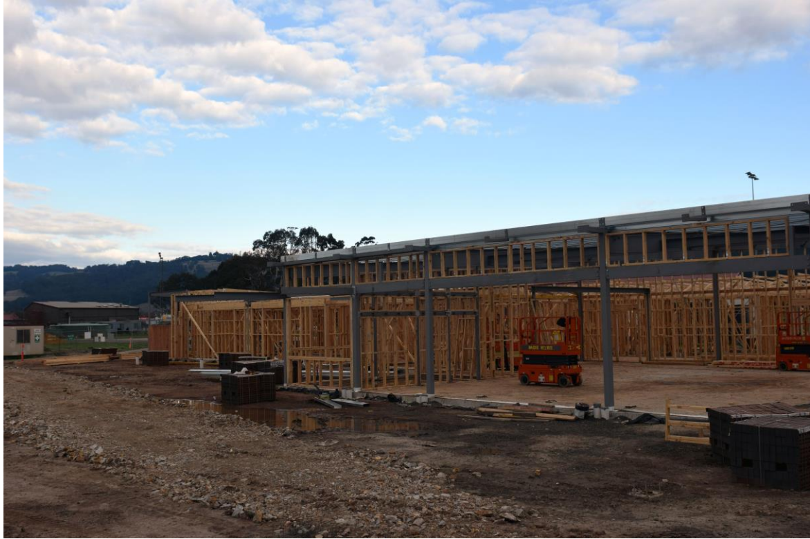
Pavilion facing north. Current Trafalgar FNC facility visible to the left.