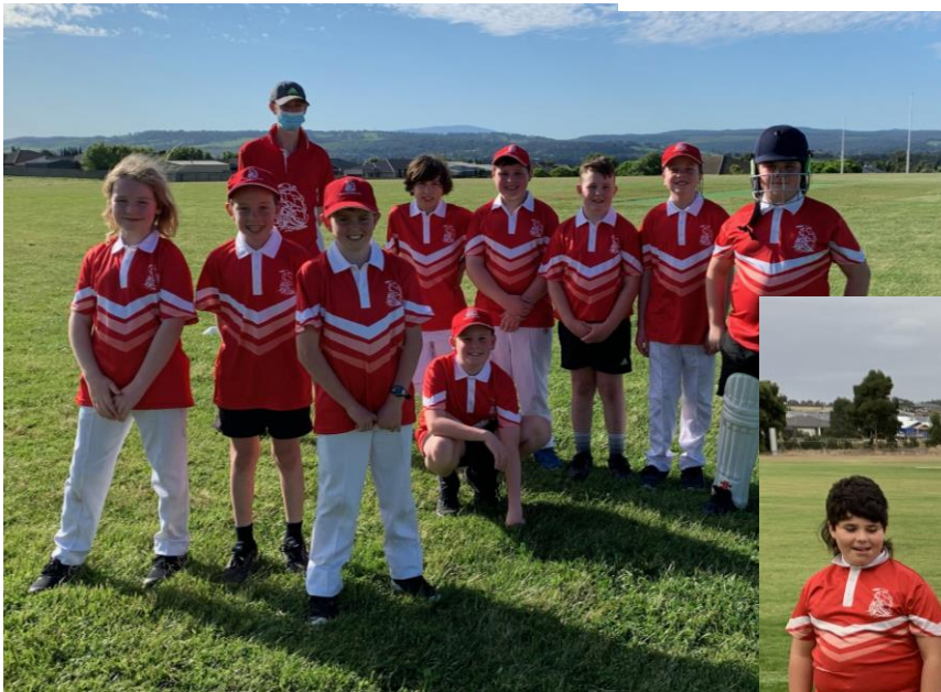
Under 12's, mask season (left) and post-mask season (below)