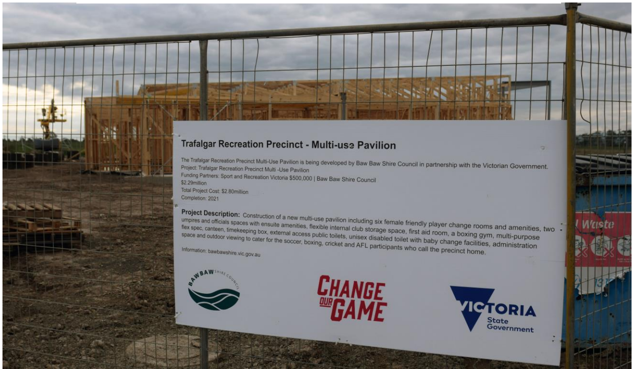
The pavilion, to serve cricket, football, soccer and boxing, is expected to be completed later in 2021.